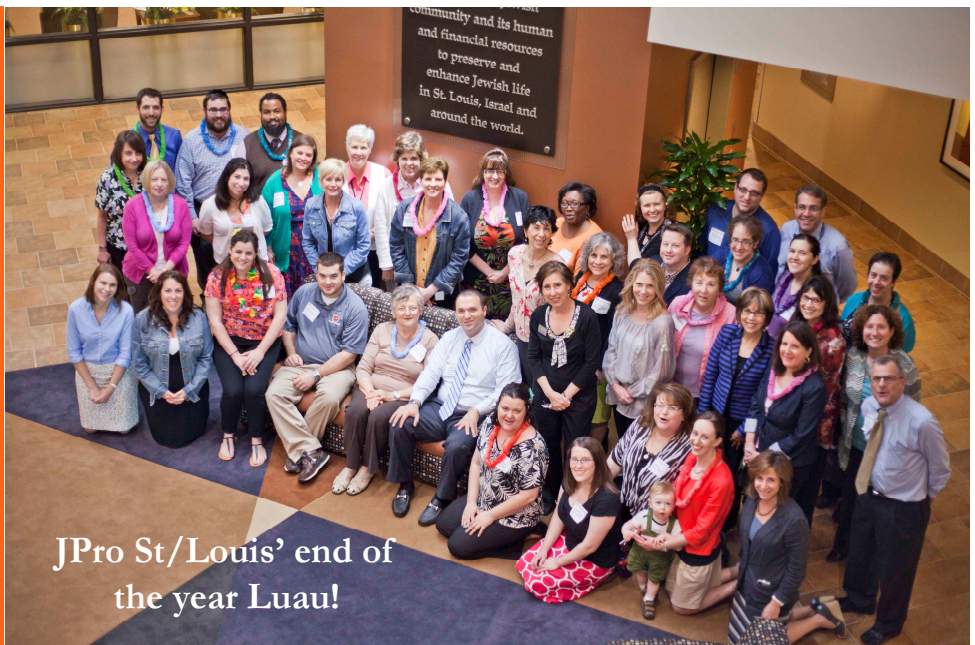
JPro St/Louis' end of the year Luau!